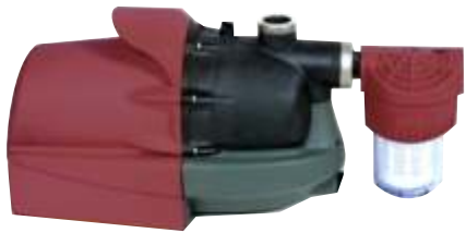
Powerful submersible water pump