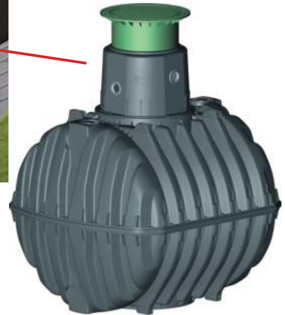
Graf Carat tank available in capacities 2700 Litre to 6500 litre and in combinations to X'000 litres