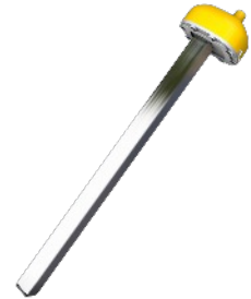
Acculevel Tank Sensor